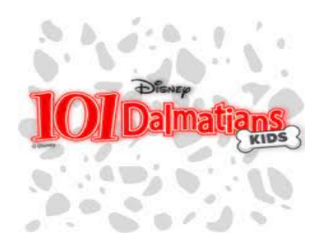
July 8th - July 13th

9 am—2 pm Monday-Thursday 2:30—8 pm Friday 12 —2 pm Saturday