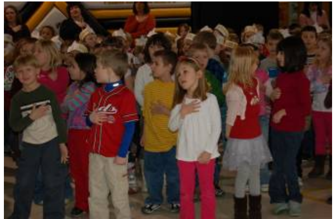
The Cleves Police Department (below) and Three Rivers Women’s Club (left) were some of the groups honored.

Miami Heights students presented local ‘community helpers’, like fire, police, postal service workers, volunteers and more with a basket of goodies and a piece of handmade art (a helping hands “thank you” wreath) in thanks for all that the helpers do in our community. The students also sang and danced (below) for the guests of honor.