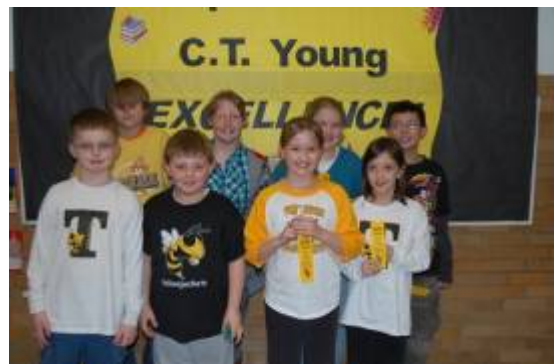
C.T. Young Gotcha winners (above), February 5