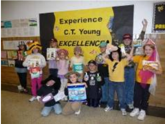
2 nd and 4 th graders at C. T. Young pose with some of the many items they collected for Haiti (above).

The Bee's Knees is a phrase meaning 'excellent or outstanding'. The exact origin is unknown but it became popular in the U.S. in the 1920s. We'll use this space every week to celebrate the successes of our students, staff, teachers and everyone in the Three Rivers Community.