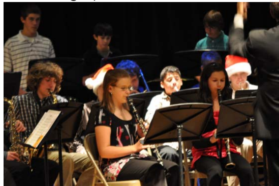
Photos from the standing room only TRMS Band concert last week (above, left & below).