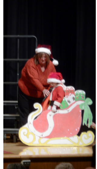
Photos from the fantastic preschool Christmas program last week (above, left & right).