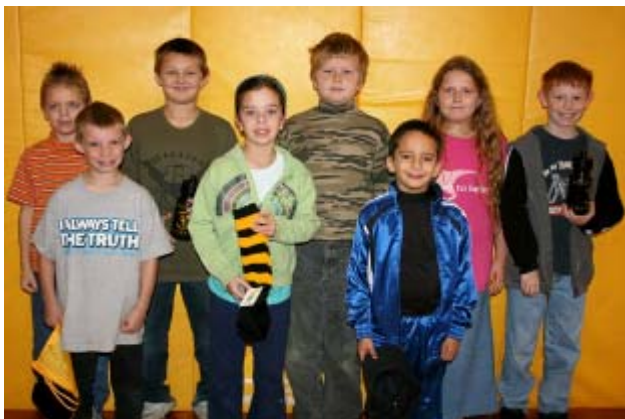
CT Young Gotcha! winners are drawn from all students who have earned daily Gotcha! coupons. Gotchas! are positive behavior coupons earned by students who exhibit model behavior. Gotcha winners are eligible for weekly, monthly and annual prizes