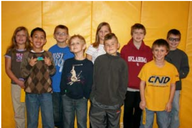
Gotcha winners from 10.31 (above), and 11.5 (right); October winners are below.