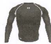
Under armor Shortsleeve SS Under armor Long Sleeve LS White, Black, Yellow or Brown

Available in Youth and Adult Sizing *Specify YS, YM, YL for youth sizes $24.99 SS/$34.99 LS