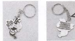
Actual Pewter Yellow Jacket Key Chain

Jewelry quality - great as backpack pull or new driver gift. Taylor Yellow Jackets imprinted on back